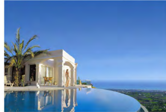
BESPOKE HILLTOP VILLAS