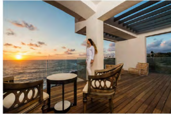
SEAFRONT LUXURY VILLAS