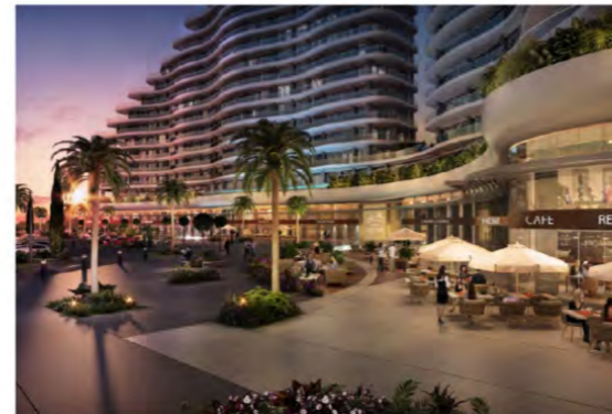
PRIME COMMERCIAL SPACE