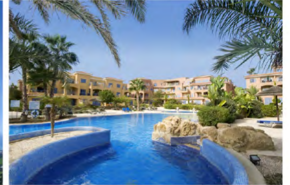
GATED RESORT RESIDENCES