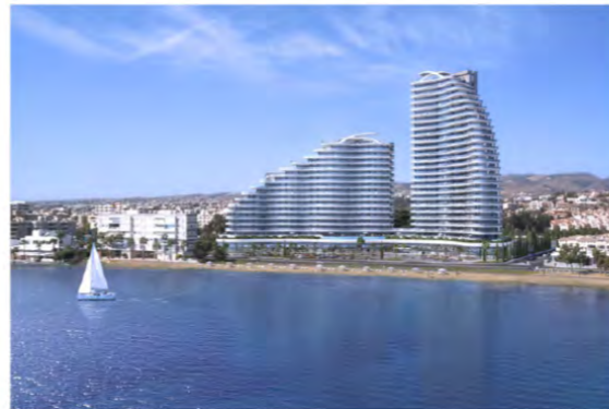
SEAFRONT LUXURY APARTMENTS