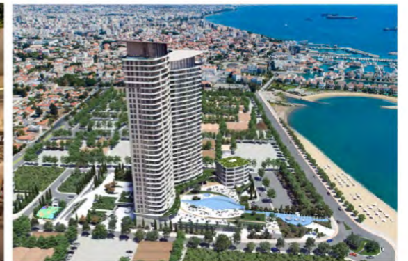
SEAFRONT RESIDENTIAL & SERVICED APARTMENTS